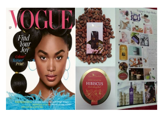
Cocoa Social Enterprise lands in Vogue

Three women, successful in their careers, leaders, and all alumni of the University of East London, returned