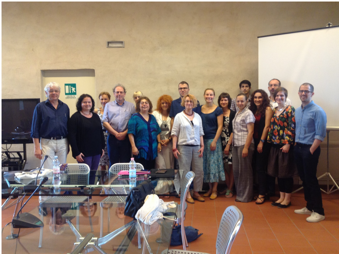
EUBORDERSCAPES Work package 9 Team

Finally, in 2014/2015 CMRB attended a series of project meetings to discuss all the above issues. These were held in Joensuu/St Petersburg, Beersheva and Grenoble.